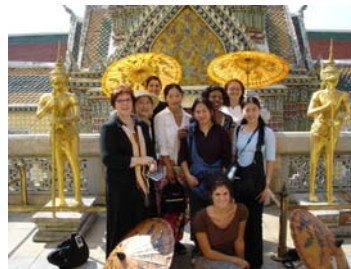
The Royal Grand Palace – Bangkok