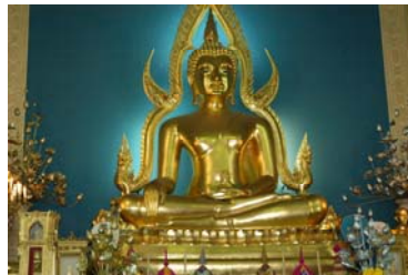
The Marble Buddha - Bangkok