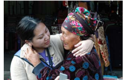
Finding relatives in Thailand