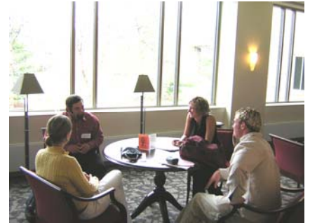
Psychology students waiting to present at MUPC.