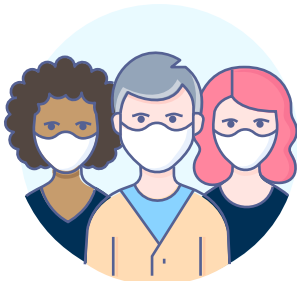
WEAR A MASK

Welcome to CSP | To support and care for the health and well-being of our community, CSP follows the CDC safety guidelines.