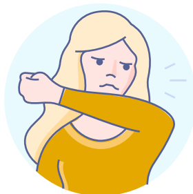
COUGH INTO YOUR ELBOW