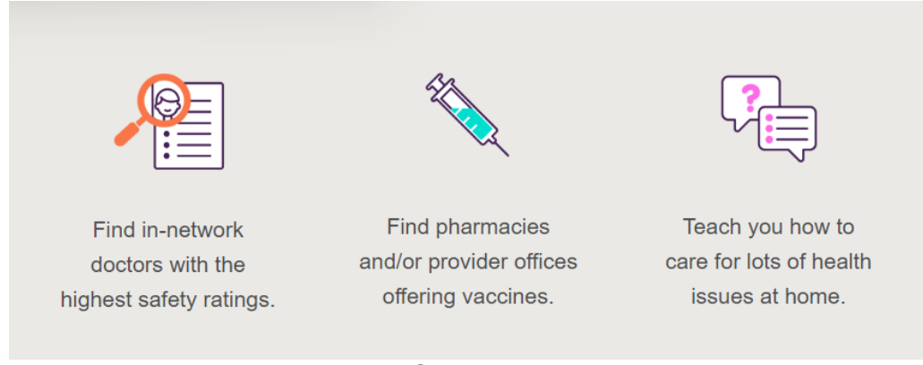
Get started here!

Thanks to your Concordia Health Plan, your Grand Rounds Health benefit is available at no additional cost. From routine cancer screenings to flu shots, Grand Rounds Health will help you get the right care the first time by finding you in-network doctors with the highest safety ratings. We'll even book your appointments for you. Say goodbye to unnecessary exams and fees.