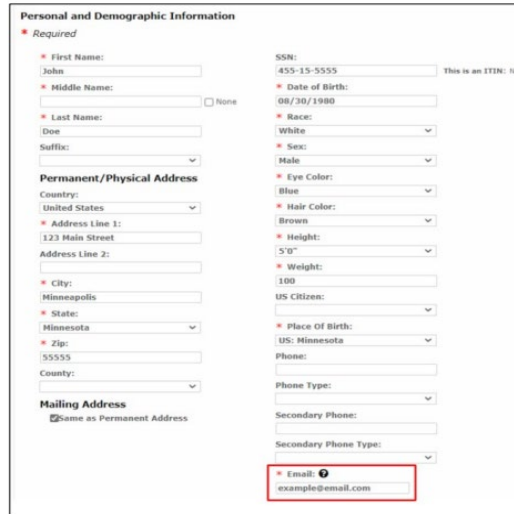
Figure 1. Email address is required.